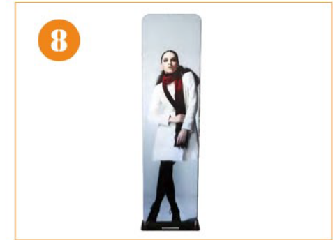
8. Completed unit with graphic shown here