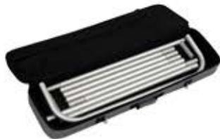
Shown with optional Silver Bag