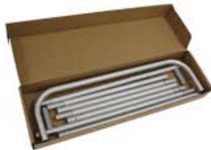
Shown with standard packaging