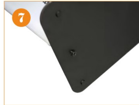
7. Attach base with provided screws