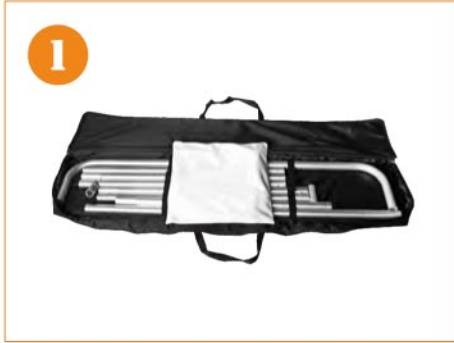
1. Open padded carry bag containing unassembled stand