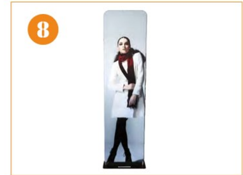
8. Completed unit with graphic shown here