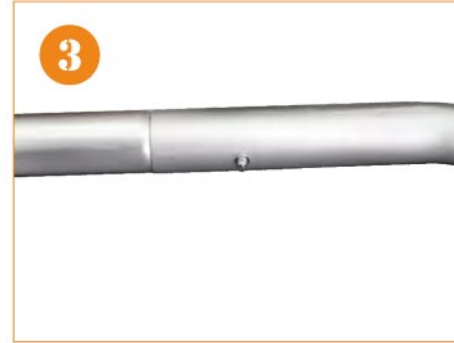
3. Lay out and assemble frame until pieces snap together securely