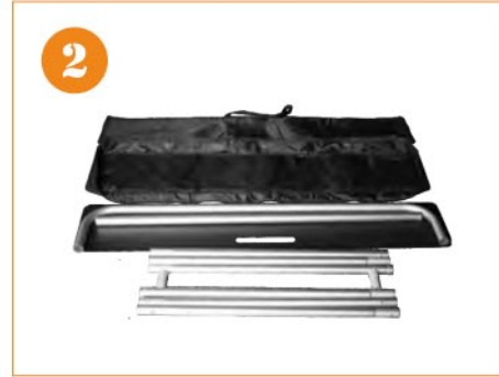
2. Remove frame components from the bag