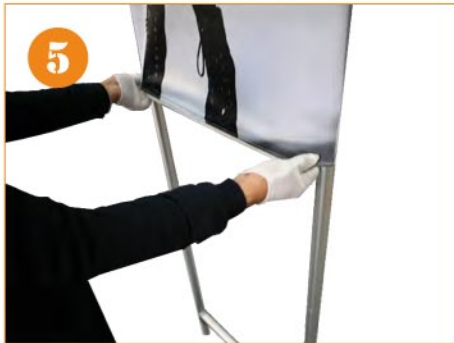
5. Carefully slide graphic over the frame to cover