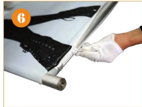
6. Fasten with zipper as shown